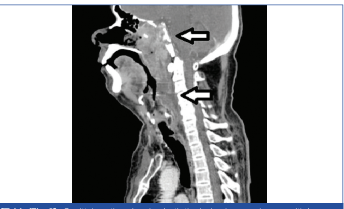
[Table/Fig-2]: Sagittal section showing both the lesion in nasopharynx with bony destruction of sphenoid sinus and collection in retropharyngeal space (white arrows).

nasal endoscopy, a mucosa covered proliferative mass was seen in the nasopharynx which was biopsied for histopathological examination [Table/Fig-4]. Biopsy turned out to be undifferentiated squamous cell carcinoma showing uniform cells with ovoid vesicular nuceli, prominent nucleoli with indistinct cell borders and numerous lymphocytic infiltrations. Patient improved with intravenous Cloxacillin, Gentamycin and Metronidazolefor two weeks followed by oral Clindamycin for two weeks as culture sensitivity showed klebsiella pneumoniae sensitive to clindamycin and neck wound was allowed to heal by secondary intention. Patient received concurrent chemoradiation with 70 Gy/35 fractions for seven weeks along with weekly cisplatin for NPC after discussion with multidisciplinary