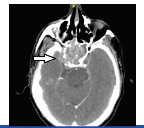
[Table/Fig-3]: Heterogenously enhancing sift tissue density in nasophaynx with destruction of bony walls of sphenoid sinus with extension into middle cranial fossa (white arrow).