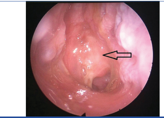
[Table/Fig-4]: Endoscopic view of right nasal cavity showing proliferative mass (black arrow) in nasopharynx covered with discharge.

team for malignancy. Patient was followed up with two-monthly nasoendoscopy and was disease free at the end of one year.